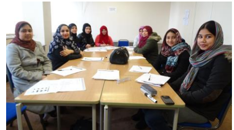
Some of the ladies attending our ESOL sessions

As this has proved successful we may run similar courses again later this year. Watch this space!